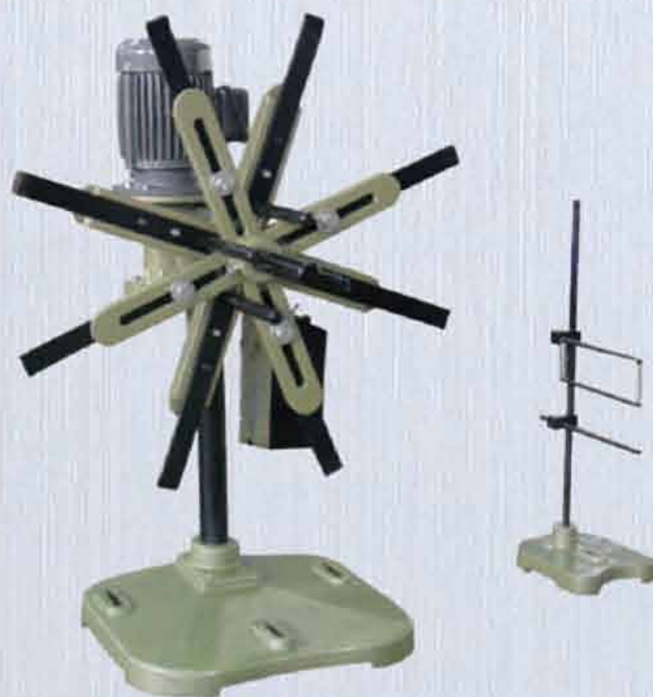
CR型 感應式 CR TOUCH SENSOR CONTROL TYPE