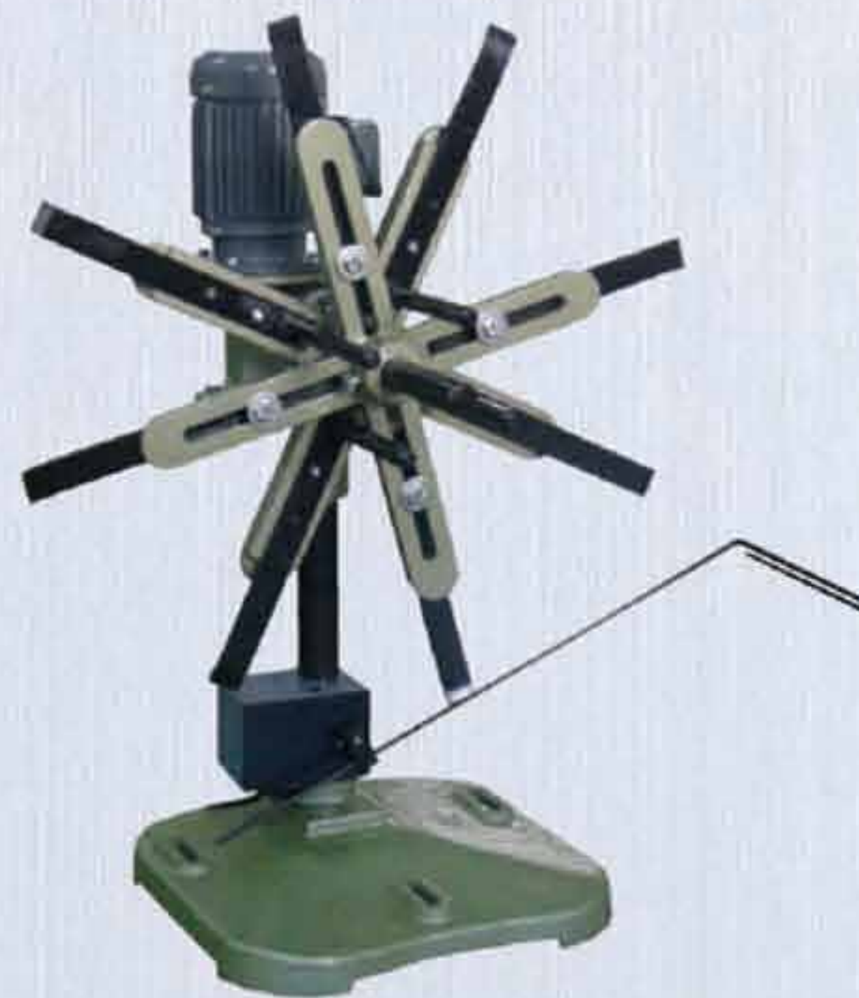
CR型 微動式 CR LIMIT SWITCH CONTROL TYPE