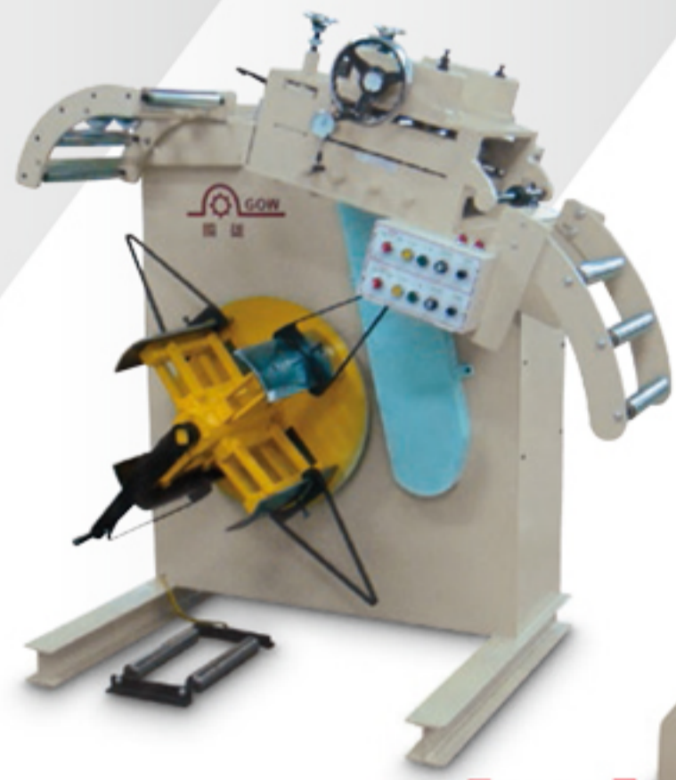
GO / GL Series