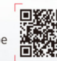
Touch Sensor Control Type CR-60