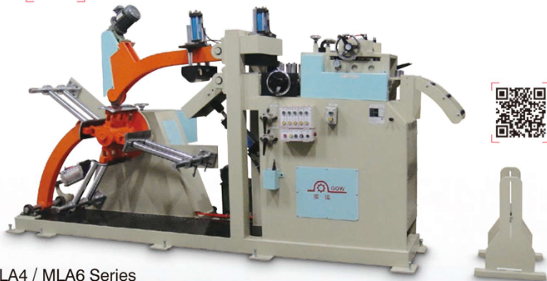
MLA4 / MLA6 Series