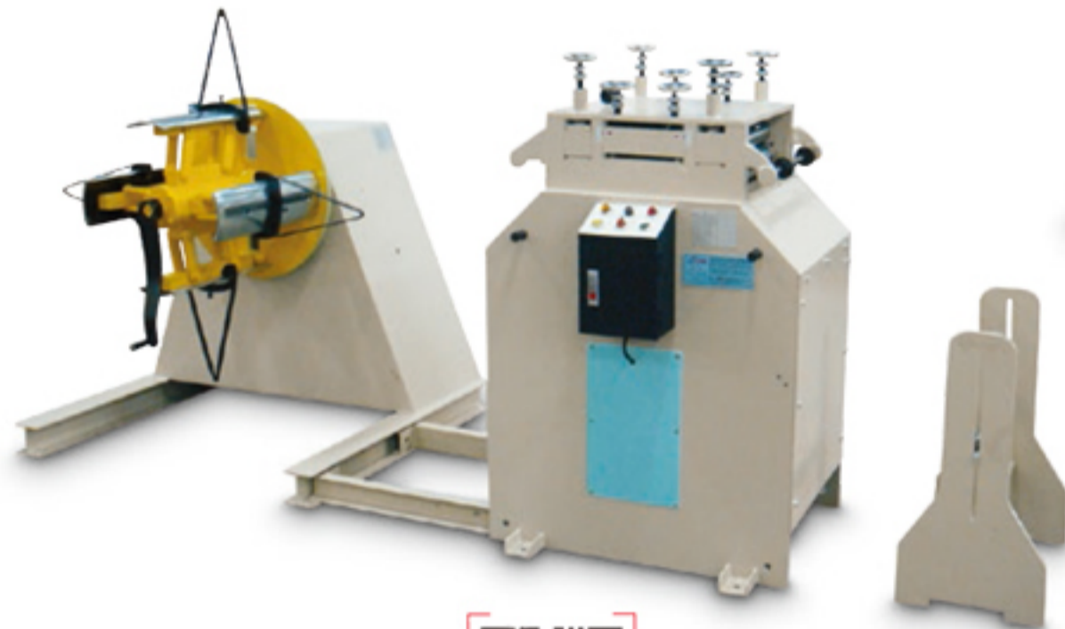
ML / MLA Series