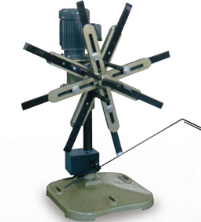
Limit Switch Control Type