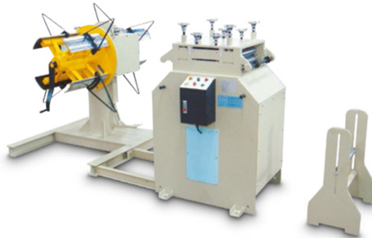
TL / TLA Series