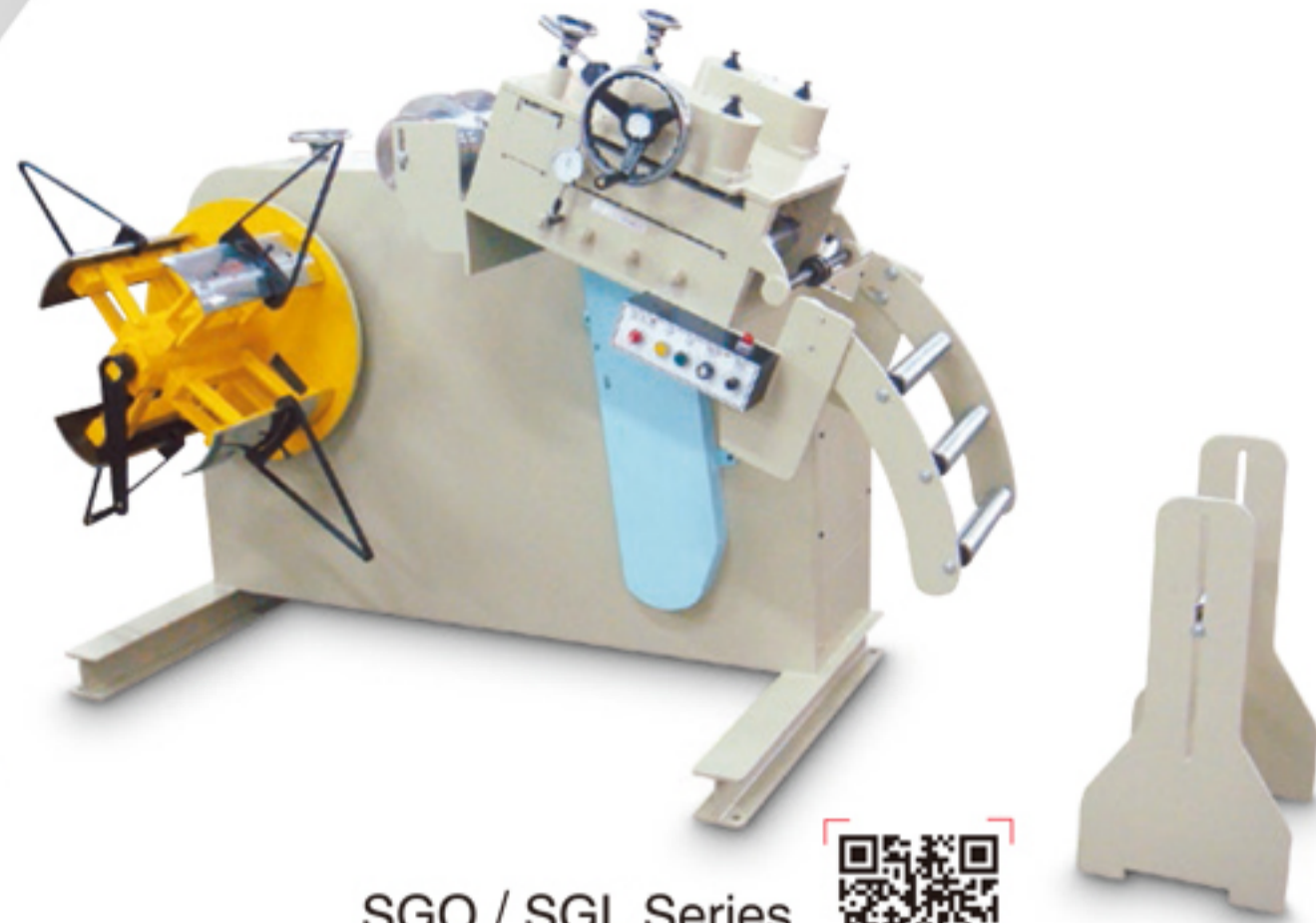
SGO / SGL Series