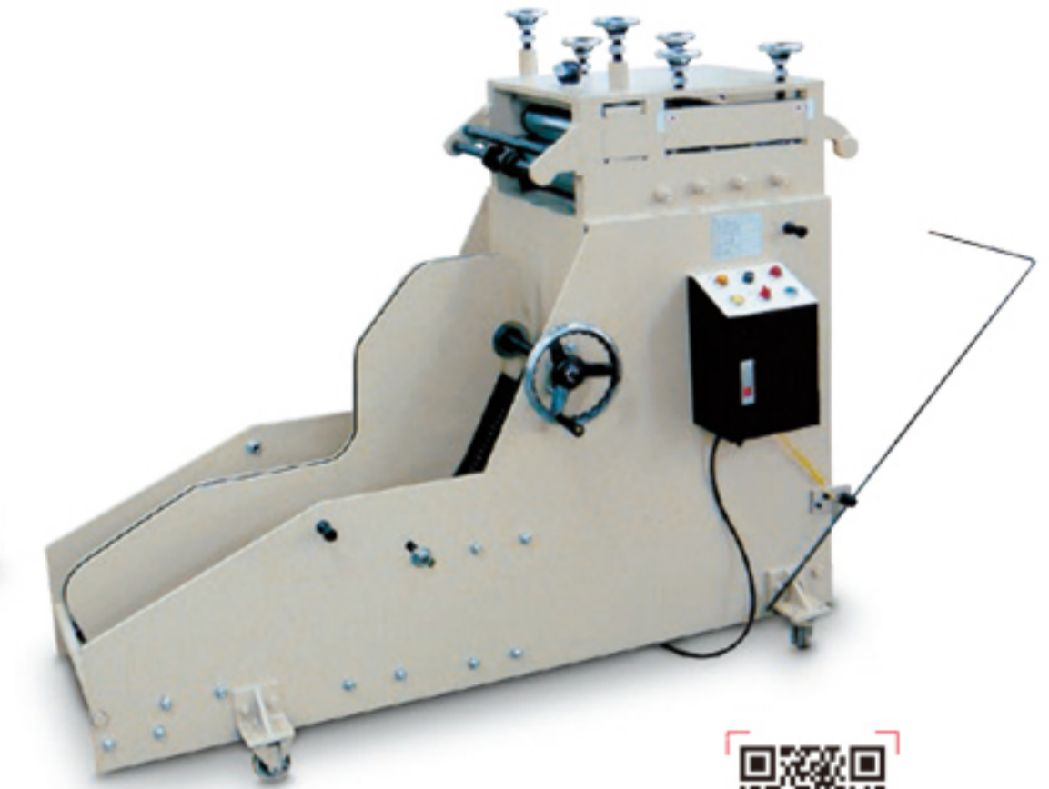
CL / CLA Series